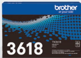
TN-3618 Ultra-high Yield Toner 18,000 pages