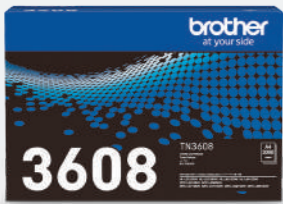
TN-3608 Standard Yield Toner 3,000 pages