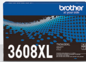
TN-3608XL High Yield Toner 6,000 pages