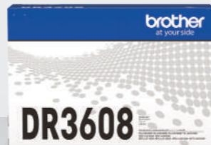
DR3608 Drum 45,000 pages (1 pg/job) 75,000 pages (3 pgs/job)