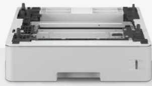
LT5505 250-sheet Lower Tray