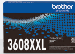
TN-3608XXL Super-high Yield Toner 11,000 pages