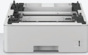
LT6505 520-sheet Lower Tray