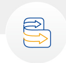
Automatic duplex printing