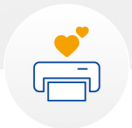
Self-Care Technology for consistent output and lower maintenance