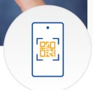
Mobile App Setup & Monitoring

Stay connected and in control with the Brother Mobile Connect App , available for download on the App Store and Google Play Store. Print, scan and manage jobs right from your phone or tablet. Enjoy intuitive touchscreen navigation, cloud access and seamless wireless printing that fits the way you work.