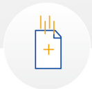
Best-in-class print speed