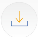
Available on App Store & Google Play Store