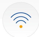
Wireless & Wi-Fi Direct