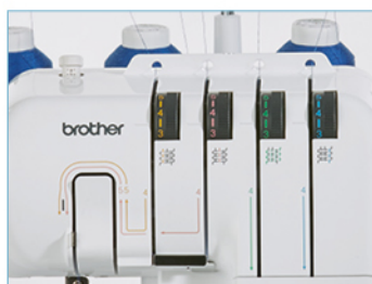
4 colour easy threading guide