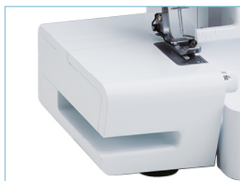
Free arm / Flat bed convertible sewing surface