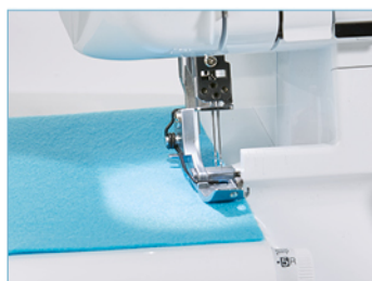
LED work light