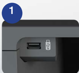
USB direct print*