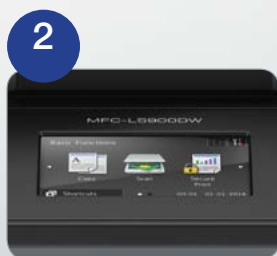
3.7" TFT Colour LCD*