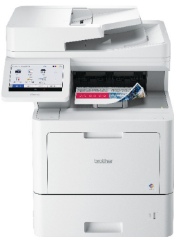
MFCL9630CDN Colour Multi-function Centre

*In accordance with ISO/IEC 17991 **TC4000 Tray connector required ****In accordance with ISO/IEC 19798 *Based on 3 pages per print job All information is accurate as of the time of publication and may change without prior notice