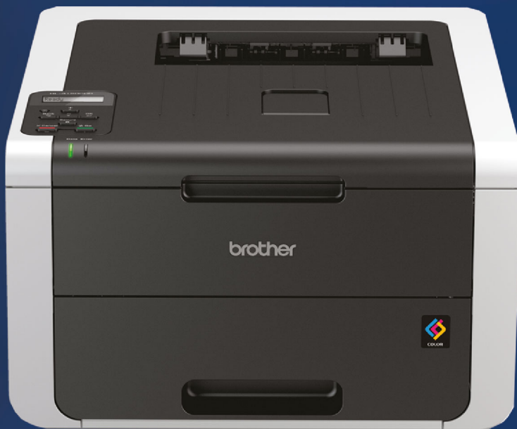
Colour LED Printer with Networking Capability

Chart your increasing productivity at 18 pages per minute.